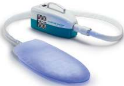
neoBLUE blanket system