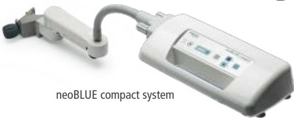
neoBLUE compact system