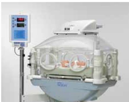
neoBLUE system positioned over an incubator

Incorporates optimal blue LED technology for the treatment of newborn jaundice