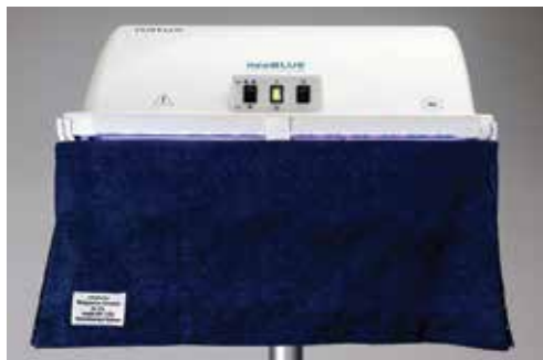
neoBLUE system shown with drape accessory

neoBLUE LEDs emit blue light in the 450 - 475 nm spectrum. This range corresponds to the peak absorption wavelength (458 nm) at which bilirubin is broken down.